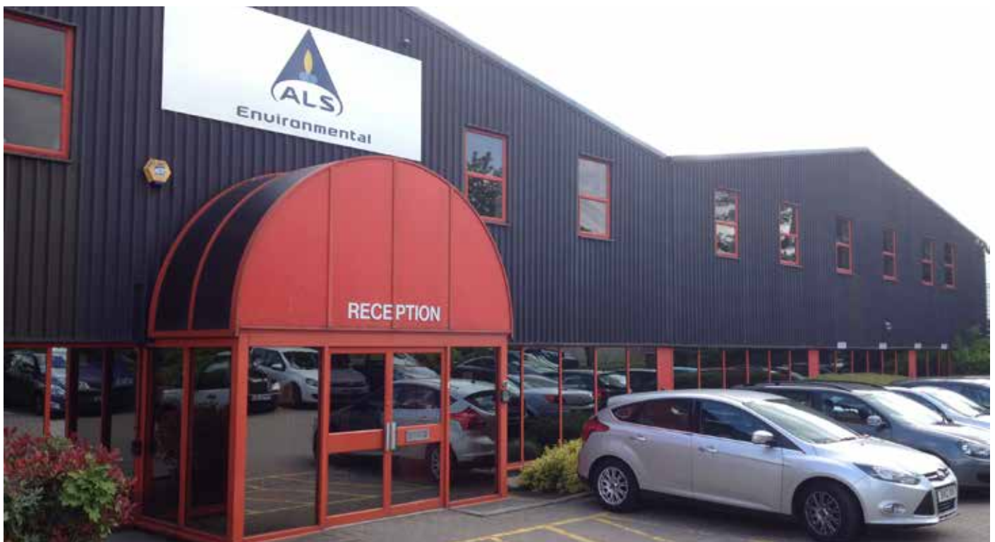
Coventry, United Kingdom

The Wakefield laboratory provide a wide range of UKAS accredited environmental testing services and was first opened in 2010. The analytical testing capabilities of the laboratory are: potable water, wastewater, groundwater, soils, potable and waste water microbiology, ecotoxicology and Cryptosporidium. The laboratory forms a network and acts as a hub where samples are brought to be tested or transported to our Coventry site for analysis.