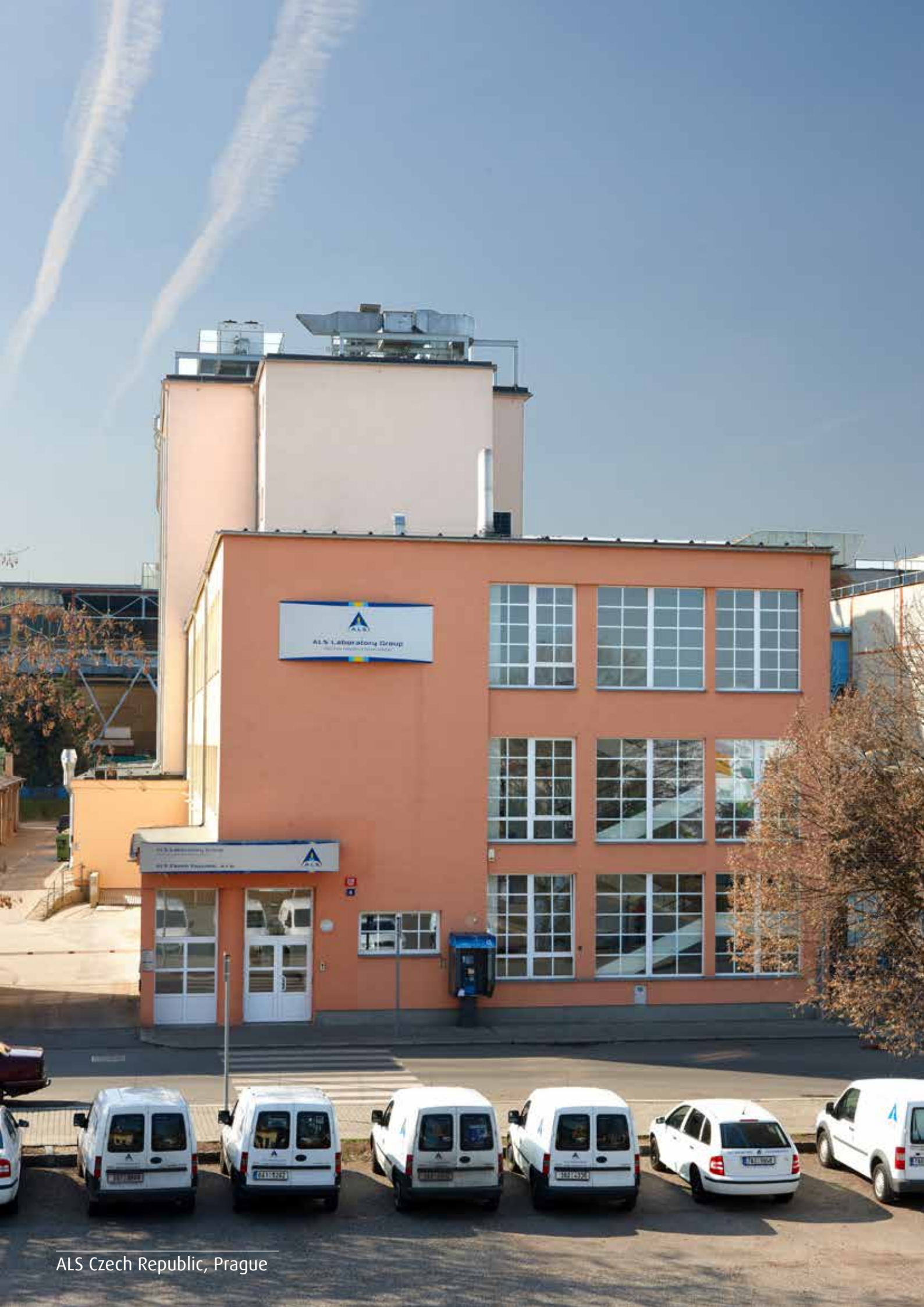
ALS Czech Republic, Prague