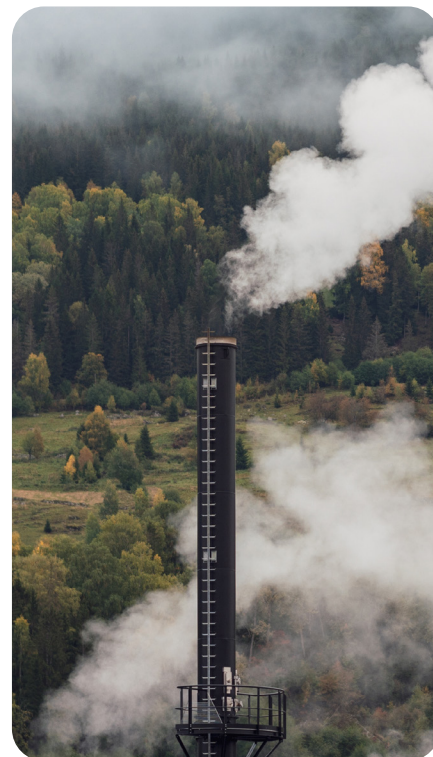
Figure 1: Illustrative picture

Testing of emissions by the OTM-50 method helps to ensure destruction processes are optimized for complete PFAS elimination to break the cycle of PFAS transfer to atmosphere, and to reduce the global load of PFAS and organofluorines on aqueous and terrestrial environments.