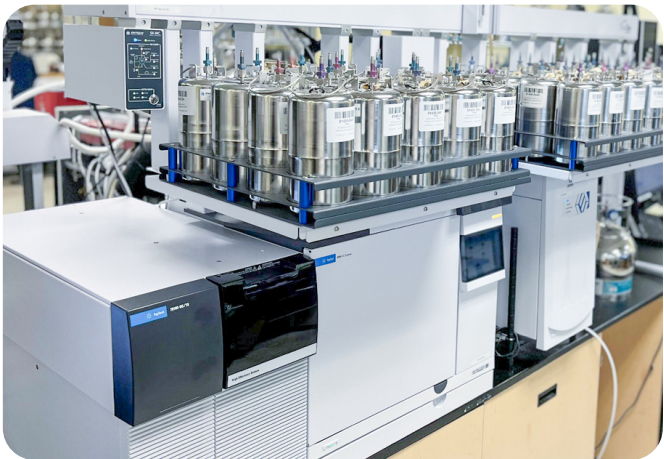
Figure 5. Automated GC-MS/MS instrumentation for OTM-50