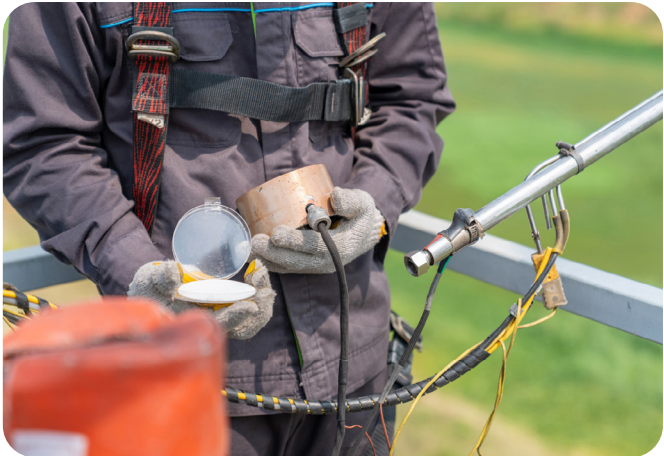
Figure 4. Field sampler assembling sampling probe and inlet filter for OTM-50 canister sampling

Please contact your ALS Project Manager or Sales representatives for more information about this important new test service.