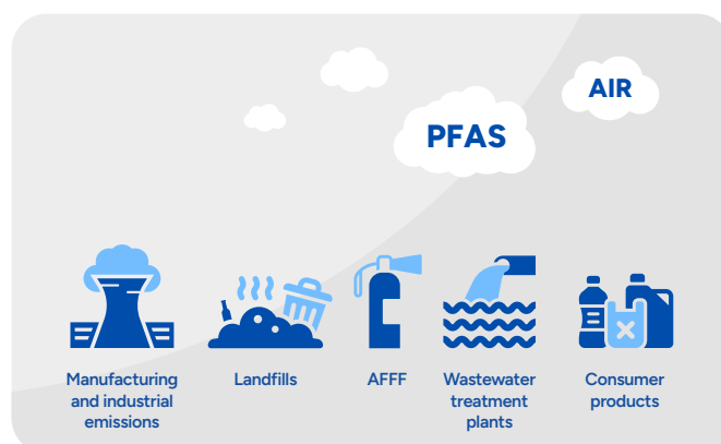
Figure 2: Common sources of PFAS to the atmosphere

A better understanding of the PFAS atmospheric transport and deposition cycle and the means to break it are urgently needed. Improved testing of PFAS in air and emissions is a first step! Until recently, reliable test methods for volatile PFAS in air have been largely unavailable and as a result atmospheric PFAS have been much less studied than PFAS in soil, water, biota, and humans.